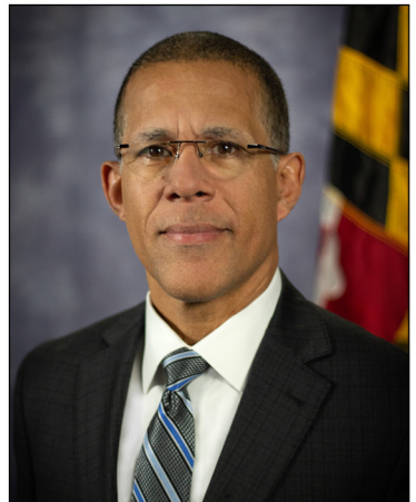
Anthony G. Brown Maryland Attorney General

In reviewing this booklet, keep in mind that many Maryland counties and Baltimore City have different landlord/tenant laws that may provide additional protections or require that you follow different procedures.