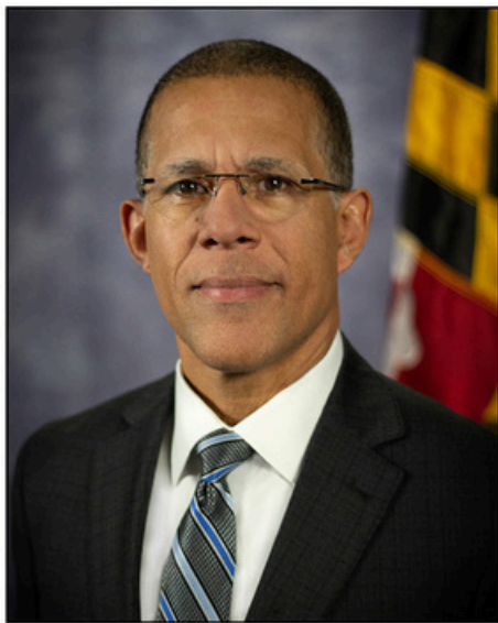
ANTHONY G. BROWN ATTORNEY GENERAL

MARYLAND OFFICE OF THE ATTORNEY GENERAL 410-576-6300 1-888-743-0023 TOLL-FREE TDD: 410-576-6372